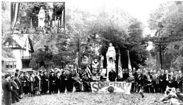
1. White Plains Columbus Day Celebration, North Broadway, cir. 1930's.

The statue on Tibbits Park has such value because it not only celebrates the enormous impact that Columbus' explorations and discoveries have had on world history, but also celebrates the history and accomplishments of Italian-Americans in the City of White Plains (not to mention the US, NYS, and Westchester).